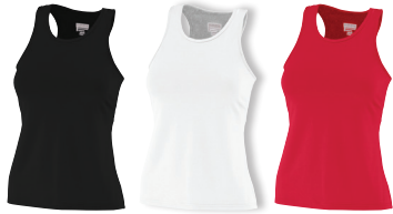
BLACK 080 WHITE 005 RED 040