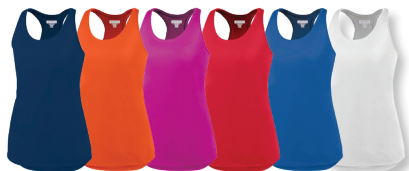
NAVY 065 ORANGE 029 POWER PINK 809 RED 040 ROYAL 060 WHITE 005