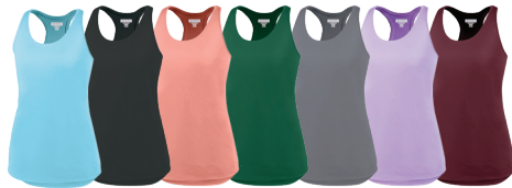
AQUA Y07 BLACK 080 CORAL 043 DARK GREEN 035 GRAPHITE 059 LIGHT LAVENDER 868 MAROON 045