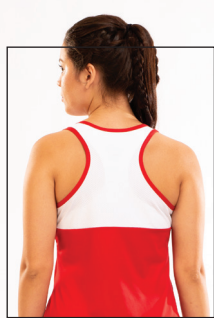
PINHOLE MESH BACK YOKE AND BACK BINDING