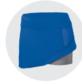
GRAPHITE INNER SHORT