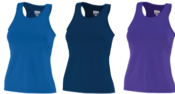
ROYAL 060 NAVY 065 PURPLE 050