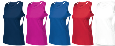
NAVY/ WHITE 301 POWER PINK/ WHITE 468 ROYAL/ WHITE 280 RED/ WHITE 400 WHITE/ WHITE 230