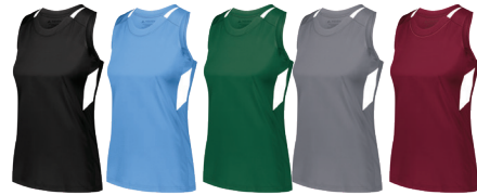
BLACK/ WHITE 420 COLUMBIA BLUE/ WHITE 293 DARK GREEN/ WHITE 438 GRAPHITE/ WHITE R04 MAROON/ WHITE 380