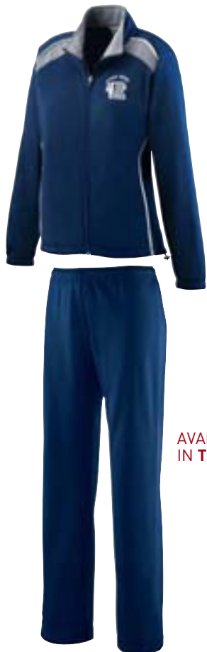
AVAILABLE IN TALL*