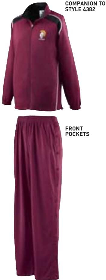
COMPANION TO STYLE 4382